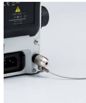
Built-in security slot