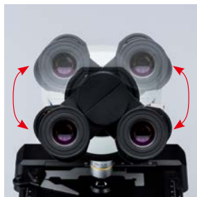
Eyepoint height adjustment