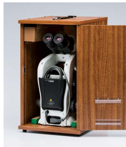
Dedicated wooden case (optional)