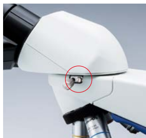
Locking pin for easy binocular rotation