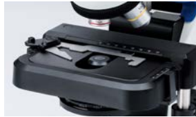
Rackless stage and stage cover