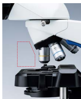
Inward-facing revolving nosepiece