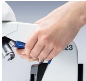
Ergonomic grip for easy carrying