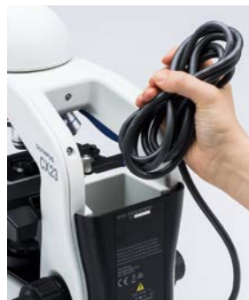
Cable storage compartment